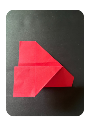
7. Fold both flaps to create the wings