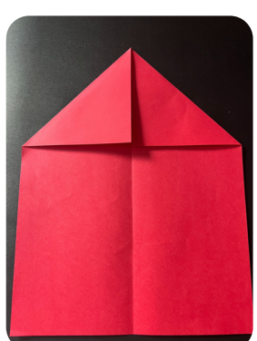
2. Unfold and then fold on the top corners to the center line