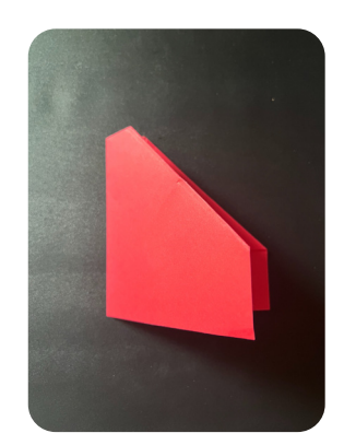
6. Fold the plane in half