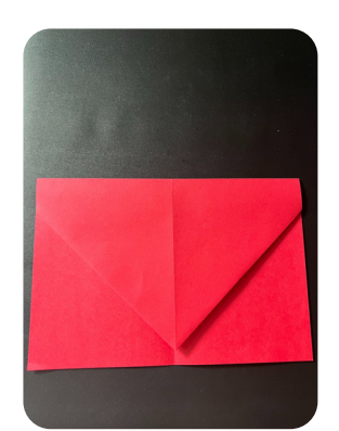
3. Fold the top peak down to the edge of the previous fold, leaving 2.3" at the top