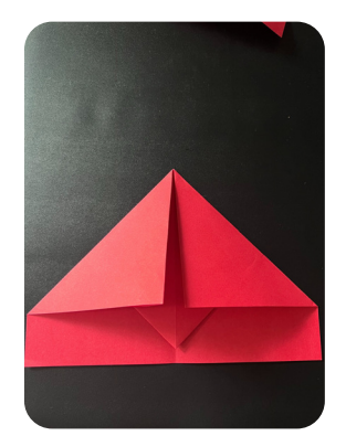
4. Fold the upper sides to the center line