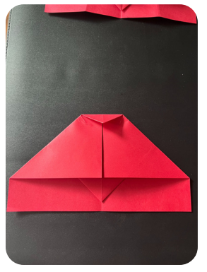
5. Fold the top about 1/2 inch